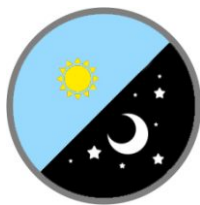
DAY/NIGHT AUTOMATIC FUNCTION