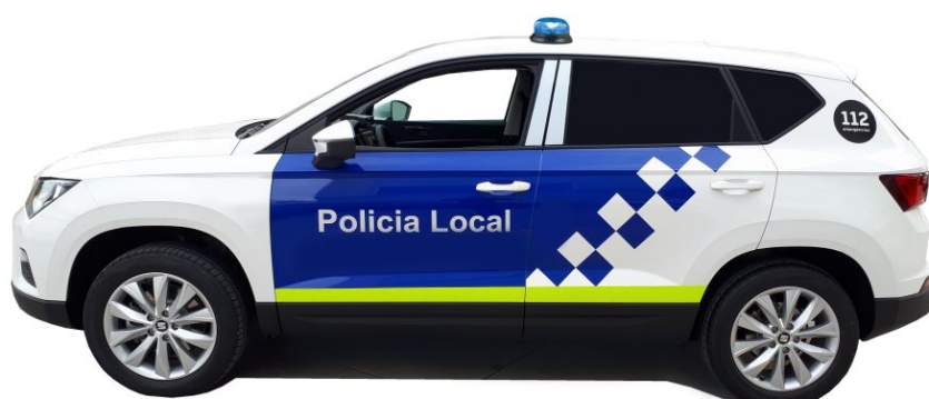
Vehicle with the LP200 Series installed.